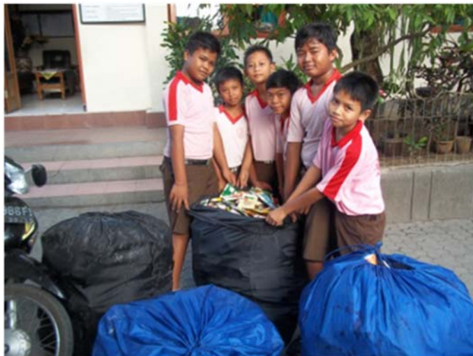
Students of SDN 4 Kerobokan are collecting and compacting carton packaging waste at their school.