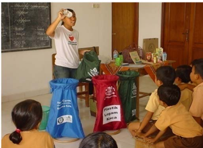
The facilitator from ecoBali is providing training on how to sort out waste for elementary students in Kerobokan, Bali.

Government of Indonesia report on the achievement of Millennium Development Goals (MDGs) 2 2010 did not provide specific recommendations for solving waste problem, but categorize it as an essential part of sanitation. The data showed reasonable improvement of access to sanitation from 25% in 1993 to 51% in 2009, but it was still below the target of 62%. Sanitation and waste which were not well managed would give serious impact to human health and the environment. Several diseases such as diarrhea, dengue fever and helminths are well associated with poor sanitation which cause the death of the children in Indonesia.