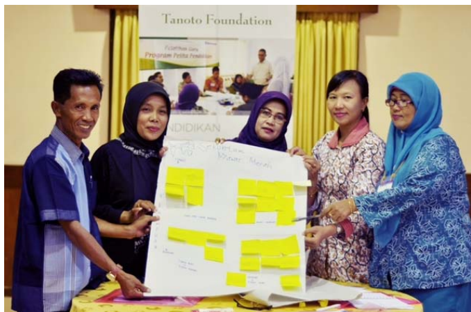
In one of the sessions of Pelita Guru Mandiri training held by Tanoto Foundation.

public elementary school in that village. The partnership started with Pelita Guru Mandiri, a training to improve the teachers' skills in a fun and creative teaching. The 3-day training was conducted for 41 teachers from 6 schools in the area of PT Inti Indosawit Subur, under the Asian Agri in Kebun Tungkal Ulu. The trainers were from Tanoto Foundation and some facilitators who had participated in the training of trainers. Tanoto Foundation provided a master trainer for each provincial program where the partner schools exist. The master trainer has the responsibilities to develop the network of local trainers/facilitators that would conduct the training for teachers.