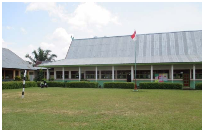
The front view of SDN 169/V Cinta Damai Village.

Tanoto Foundation has been working in partnership with Cinta Damai Village since 2010. Their first activity was to map the condition and quality of elementary schools within the operational area of their corporate partners or business unit. The mapping has identified schools with problems in terms of transportation access, teacher's quality, poor infrastructure quality, and teacher capacity building system. Tanoto Foundation Team then visited the school to discuss and explore more specific needs that the schools may have. Tanoto Foundation then set a plan of actions and prioritized urgent activities to be addressed immediately. This was done with the consideration of