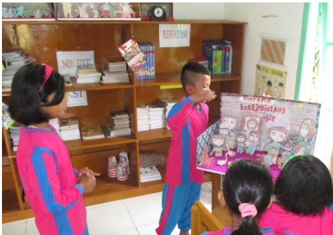
SDN 169/V Cinta Damai students practice creative learning method by using diorama as a storytelling media.

The main challenges faced are the number of the students still below 200, poor access of transportation to school, and status of honorary teachers. In the future, Tanoto Foundation will be collaborating with the local government to strengthen the trainer capacity and make SDN as the pilot school for the other educational institutions.