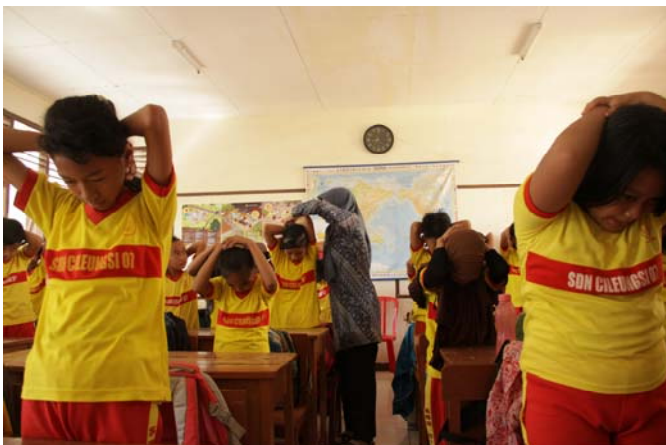
Disaster preparedness training in anticipating earthquake, at Elementary School #7 in Cileungsi.

One of the focuses of National Disaster Management (DM) is to increase the multi-stakeholder partnership in disaster management. It has shifted the paradigm of DM mandated under Law No. 24/2007, stating that the implementers and responsibilities of DM which was used to be in the hand of government, and now becomes the responsibility of joint stakeholders. Having said that, increased of community participation, partnership building with non-governmental organizations, education institution and National Disaster Mitigation Forum become many focuses needed to be developed in achieving DM effectiveness in Indonesia 1 . In implementing DM, the initiatives to build partnership with private companies were also intensified, with a focus in capacity building and effectiveness of disaster prevention and mitigation 2 .