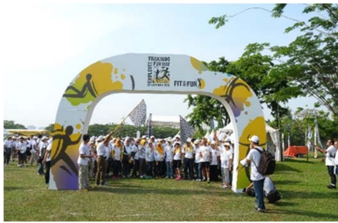
Charity Fun Walk.

In Indonesia, HOPE worldwide activities are conducted by Yayasan HOPE Indonesia (YHI), established since 1994, with activities spreading in 15 provinces and its service focuses on health, education, community development and natural