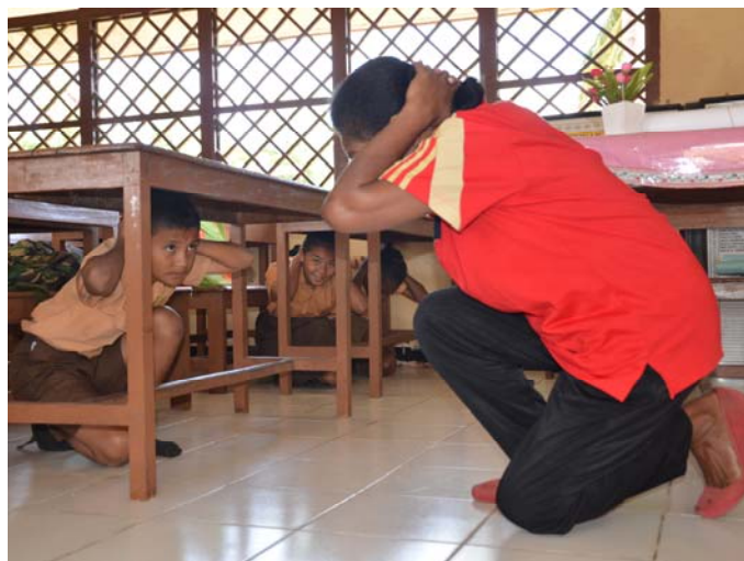
Teachers and students of SDN Nunbaun Delha, Kupang during disaster preparedness training.

All activities involved external parties in disaster preparedness area: local Government institutions, National Search and Rescue (SAR) Agency, and Regional Disaster Management Agency (RDMA) in the areas where the SD/SDN are located. Participating elementary schools were: SD Inpres 1 Ujuna, Palu; SD Inpres Polder, Merauke; SDN 1 Sungai Kapitan, Pangkalan Bun; SDN Meunasah Ara, Meulaboh, Aceh; SDN 07 Baruga, Kendari; SDN 2 Rumah Tiga, Ambon; SDN Nunbaun Delha, Kupang; SDN 07 Cileungsi, Bogor; SDN 060931, Medan; SDN 65 Jambula, Ternate; and SDN 09 Tapakis, Padang. The training materials provided to the teachers and students were: how to